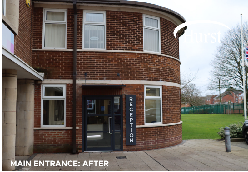
MAIN ENTRANCE: AFTER