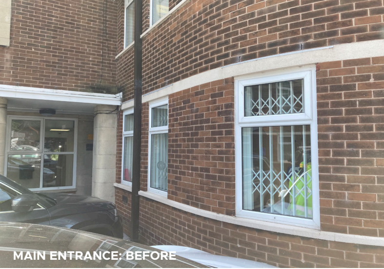
MAIN ENTRANCE: BEFORE